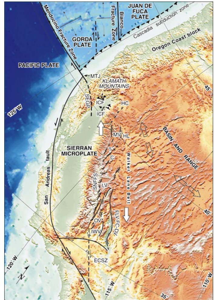
Figure 1. Oblique Mercator projection of western Cordillera about preferred Sierra Nevada–North American Euler pole of Argus and Gordon (2001). Direction of instantaneous Sierra Nevada–North American motion is vertical everywhere in projection. Strike-slip faults of Walker Lane belt are subparallel to Sierra Nevada–North American motion; normal faults strike \sim 45^\circ clockwise of that motion; and major graben and zones of extension are located in areas where locus of deformation along eastern Sierra is steps eastward in releasing geometry (Quaternary faults modified from Jennings, 1994). MTJ—Mendocino triple junction; SEGP—subducted southern edge of Gorda plate; CB—Cape Blanco; ICF—Inks Creek fold belt; HC—Hat Creek graben; A—Lake Almanor structural basin; MV—Mohawk Valley; HL—Honey Lake fault; T—Lake Tahoe basin; C—Carson Valley; LV—Long Valley; SNFFS—Sierra Nevada frontal fault system; I—Independence fault; OV—Owens Valley; IWV—Indian Wells Valley; ECSZ—Eastern California shear zone; DV—Death Valley.

and normal faulting along the eastern margin of the Sierran microplate in the context of rigid block translation parallel to Sierra Nevada–North American motion (Fig. 1).